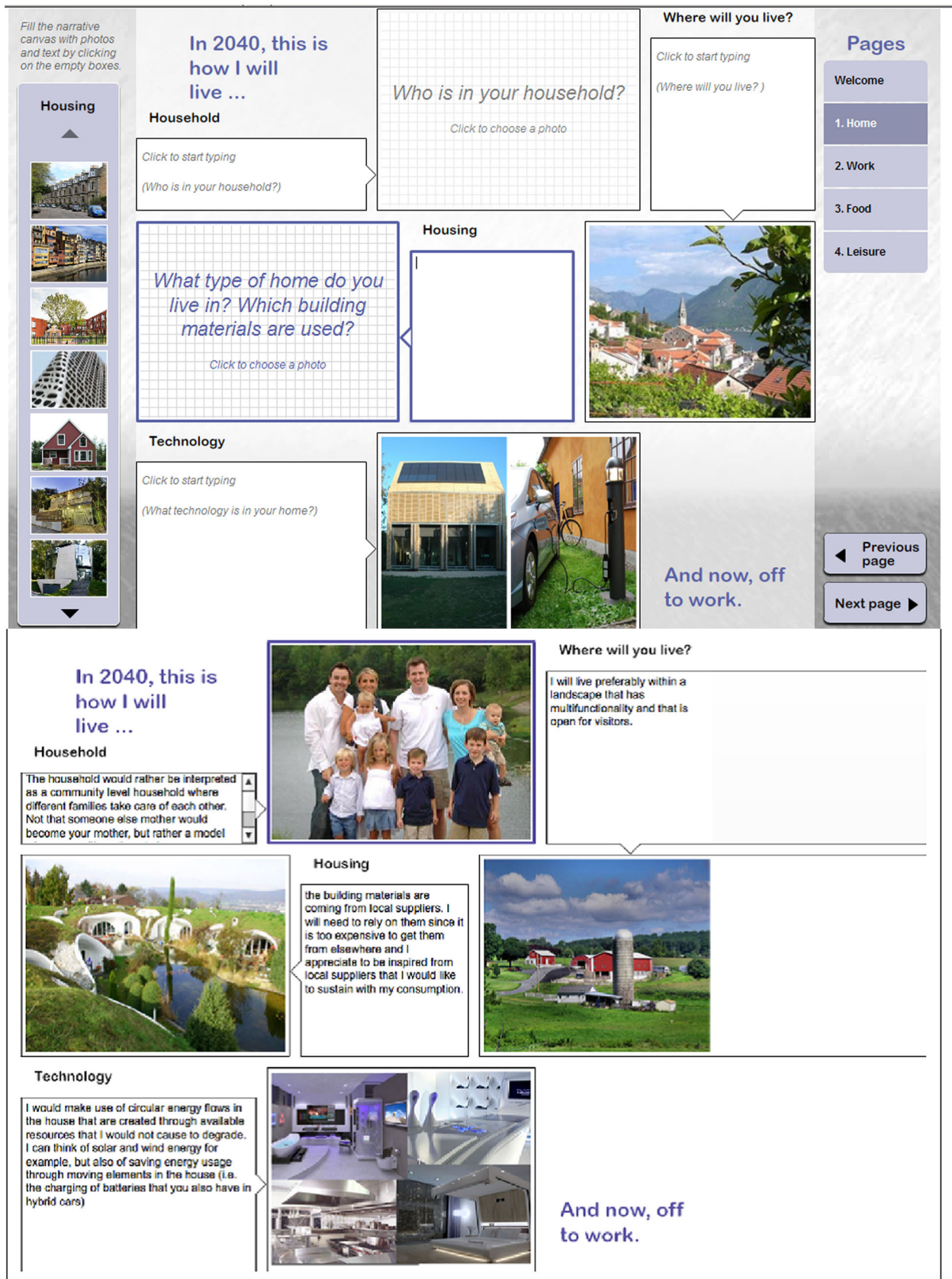
Fig. 2 Page of the individual canvas tool showing the visions on future living space empty and completed by one of the stakeholders